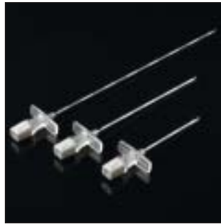
Insulated needles ease insertion