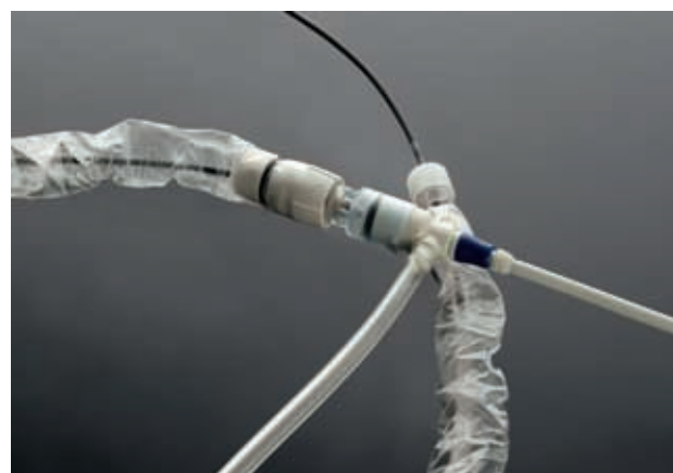
Tuohy Sheath Adapter assembled with Tuohy Cath-Gard® over Arrow Sheath and Bipolar Pacing Catheter.

CE Mark "X" indicates products available for international sale