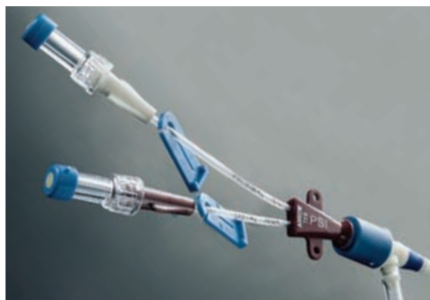
2 Lumen Companion Catheter inserted through Arrow Sheath.