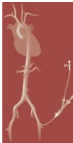
Exclusive sheath design negotiates tortuous vessels from femoral artery insertion site to carotid artery without kinking or collapsing.

For more information on this exceptional sheath for carotid artery access, call your Arrow representative or contact us by calling 800 523-8446 or 610 378-0131.