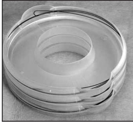
CATALOG NUMBER RM01 Guide Wire Basin

THE RINGMASTER™ GUIDE WIRE BASIN is a multi functional product designed to organize, hydrate and facilitate identification of wires and catheters on the sterile field. Packaged individually, 10 units per box.